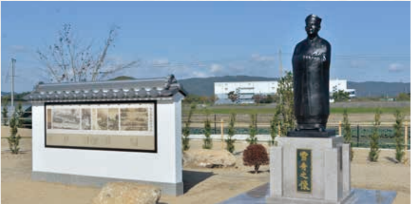
| MAP >> I-4 |

The ravine in the upstream part of Makidani River, a tributary of the Takahashi River, has a charm that is unique in the Soja district with its genial climate. The harmony of the rocky beauty, the stream, and the changing of colors in the autumn produces magnificent natural beauty, so this place has been designated as a national scenic spot.