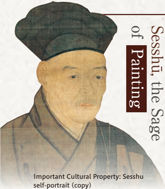
Sesshū, the Sage of Painting

Important Cultural Property: Sesshu self-portrait (copy) (Fujita Art Museum Collection, Osaka)