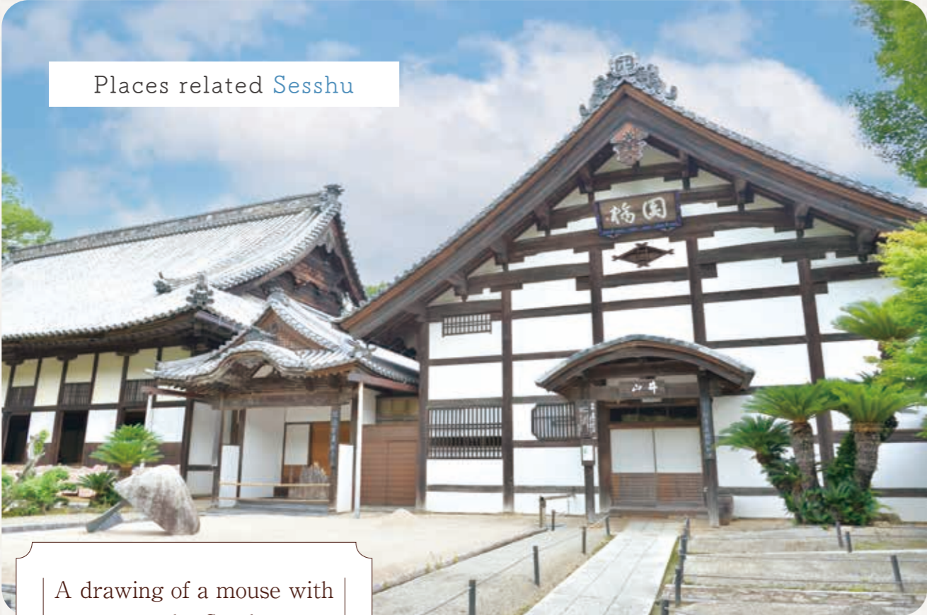
Places related Sesshu

Sesshu, a young monk at Hofuku-ji Temple, did nothing but draw pictures instead of ascetic training. The Buddhist priest could not stand and watch any longer so he tied Sesshu to a pillar as a punishment. After a while, the Buddhist priest went to untie the rope and found that a mouse was about to bite Sesshu's toes. The Buddhist priest was startled and tried to chase away the mouse but the mouse wouldn't move. Wondering why, the Buddhist priest approached and realized that it was a mouse Sesshu had drawn with his toes using his tears. The Buddhist priest was impressed and from this point on, gave permission for Sesshu to keep drawing.