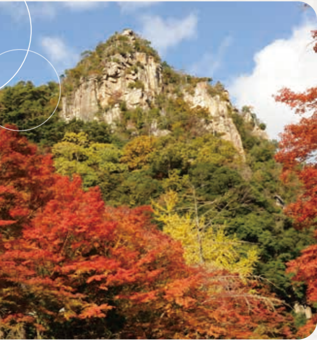
a national scenic spot.

Iwayama wa ten no hashira no moji aru mo