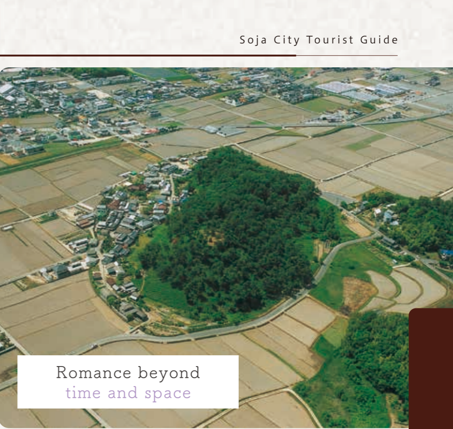
Romance beyond time and space

When the Emperor found out that Kurohime had left the imperial courts, he was devastated. Out of longing for her, he visited Kurohime under the pretense that he was going on a trip to Awaji, and they spent some intimate time together. However, the Emperor still had to return to the capital. Poems about the pain and sadness of their love still remain today in this place.