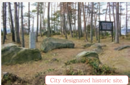
City designated historic site.

This castle is famous for being the main stage for the "Battle of Fukuyama", as recorded in "Taiheiki (Chronicle of Medieval Japan)". This battle was a preliminary skirmish to the "Battle of Minatogawa" where Kusunoki Masashige was killed. 3rd year of Kenmu (1336), Ashikaga Takauji rebelled against Emperor Godaigo's "Kenmu no Shinsei (Kenmu Restoration)". Even though Ashikaga Takauji lost his battle in Kyoto, his army regained strength and returned to Kyoto from land and sea. On the Emperor's side, Oida Ujitsune, a military commander under the flag of Nitta Yoshisada barricaded in Fukuyama-jo castle. Ashikaga Tadayoshi (brother to Takauji) was leading a large army consisting tens of thousands of soldiers through the Sanyodo road. Oida Ujitsune met this enemy force with merely 1,500 soldiers. Fierce battle lasted for three days and three nights. The battle ended when Oida Ujitsune was defeated at the Bizenmitsushijo castle. At altitude of 302m on the summit of Mt. Fukuyama, there was a temple named Fukuyama Temple, a mountain esoteric Buddhist temple built in the Heian period. Judging from the remains of the gate, earth mound, well, temple foundation stone and Kawara roof tile, we can presume this temple was abruptly converted into Fukuyama castle.