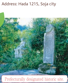
Prefecturally designated historic site.

It is known as the oldest temple in the Chugoku region, built in the first half of the Asuka period (7th century) and the core cornerstone of the tower remains. From the patterns on the excavated tiles, it is believed that an immigrant clan, the Hata clan was involved in the construction of the temple.