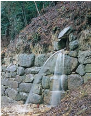
The floodgate in the valley