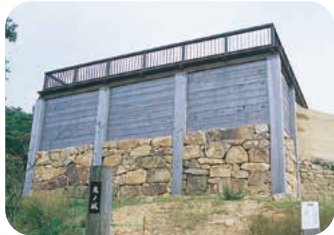
Kakuro (a Corner Tower)