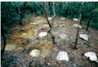
Cornerstone ruins in castle area