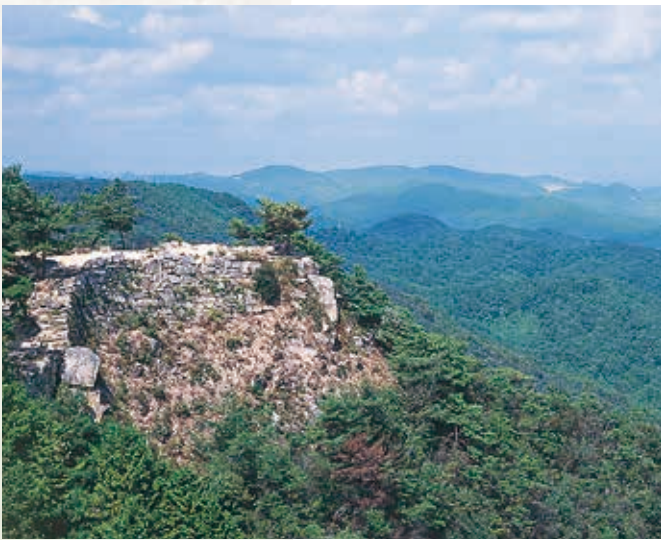
The High Stone Wall (Byobuore)