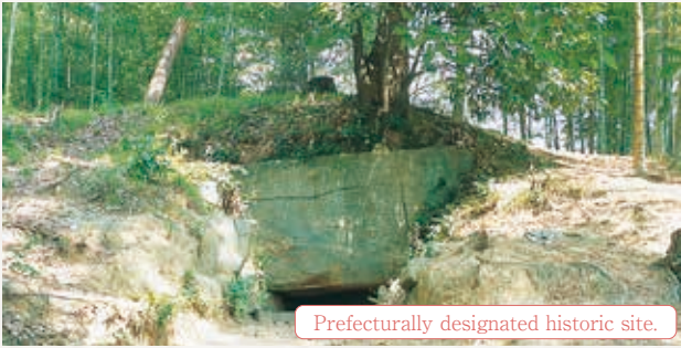
Ezaki Burial Mound | MAP >> H-6 |

Ezaki Burial Mound is a keyhole-shaped burial mound with a total length of 45 meters built on a hill to the west of Kokubun-ji. This burial mound is the last keyhole-shaped burial mound in Okayama prefecture, built at the end of the 6th century following the Koumorizuka burial mound. The house-shaped sarcophagus enshrined in the horizontal stone chamber uses the same namigataishi (shell limestone) from Ibara as the Koumorizuka burial mound.