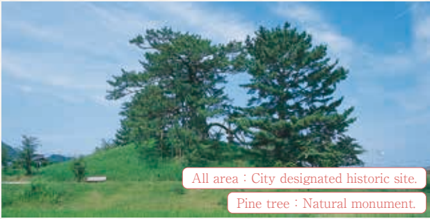
Sumou Toriyama Burial Mound | MAP >> G-7 |

Miyayama Burial Mounds are a group of burial mounds dating from the late Yayoi period to the early Kofun period, located on Mt. Miwa to the south of Kibiji Arena. It consists of mass graves with various types of burials and keyhole shaped burial mounds. Excavated clay ritual vessel stands have patterns similar to those excavated from ancient burial mound in Nara prefecture, including the Hashihaka burial mound.