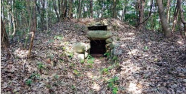
Midoriyama Burial Mounds | MAP >> G-5 |

Ezaki Burial Mound is a keyhole-shaped burial mound with a total length of 45 meters built on a hill to the west of Kokubun-ji. This burial mound is the last keyhole-shaped burial mound in Okayama prefecture, built at the end of the 6th century following the Koumorizuka burial mound. The house-shaped sarcophagus enshrined in the horizontal stone chamber uses the same namigataishi (shell limestone) from Ibara as the Koumorizuka burial mound.