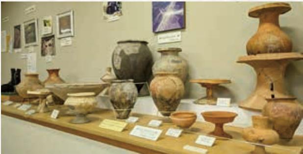
Buried Cultural Property Learning Facility | MAP >> H-4 |

This is a group of 38 ancient burial mounds dating from the 4th to the 7th centuries built on a ridge overlooking the Takahashi River. Among them the Ichhoguro no.1 Burial Mound, which is believed to have been built in the first half of the 4th century, possesses a total length of 70 meters and is the second largest Zenpou Kouhou burial mound (square-front/square-back tomb) in Okayama prefecture.