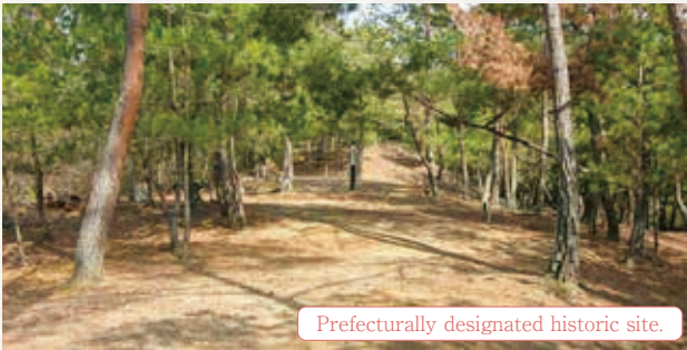
Miyayama Burial Mounds | MAP >> E-6 |

Midoriyama Burial Mounds is a group of burial mounds built from the mid to the late 6th century located northwest of Kokubun-ji in the Midoriyama area. This burial mounds group consists of 22 tumuli, most of which have horizontal stone chambers. Among them the 6th, 7th, 8th tombs lined up on the ridge of the hill allow you to see the changes in the structure of the horizontal stone chambers.