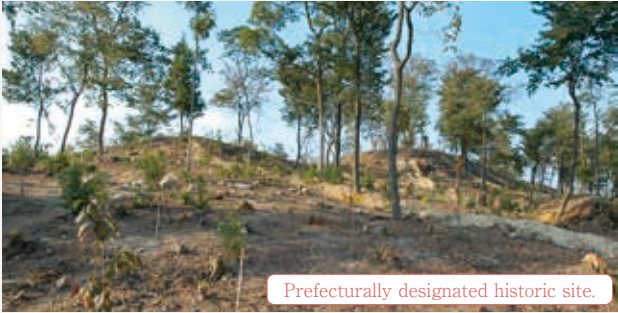
Ichhoguro Burial Mounds | MAP >> Small-scale Map |

Sumou Toriyama Burial Mound is the largest rectangular burial mound in the Kibi region, measuring 35.5 meters by 38 meters on one side and approximately 5 meters in height. It was built in the late 5th century as a burial mound for local chieftains. The origin of the name came from a sumo ring as the plateau resembles the ring. The black pine at the top of the burial mound is approximately 450 years old. It withstands rain and snow and shows the importance of history.