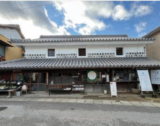
Machikado Kyodo Museum | MAP >> F-5 |

This is the building of the former Soja Police Station that was constructed in 1910, and is the only surviving example of Meiji Western-style architecture in the city. On display in the museum are many traditional industry materials, mainly from the Meiji period, relating to Bitchū medicine, Aso castings, soft rushes, etc.